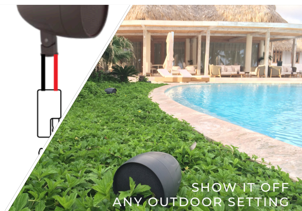
SHOW IT OFF ANY OUTDOOR SETTING