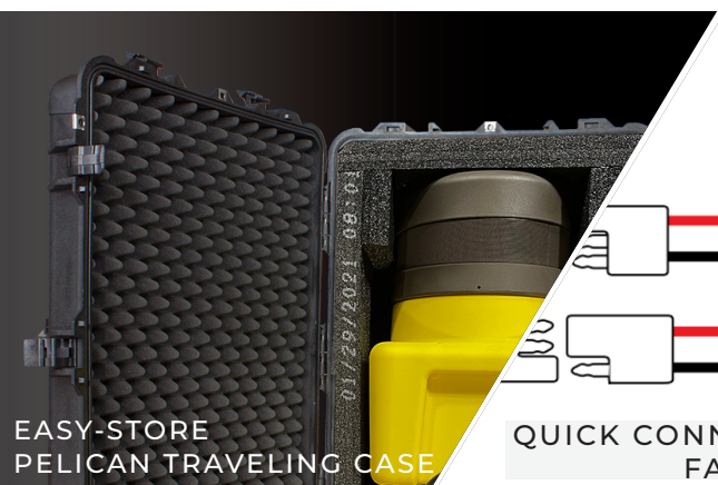
EASY-STORE PELICAN TRAVELING CASE